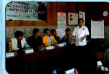
Regional Meeting 2 Padang State University Februari 2020 - Padang